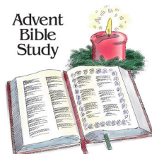
Advent Bible Study