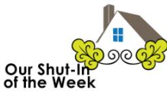
Our Shut-In of the Week